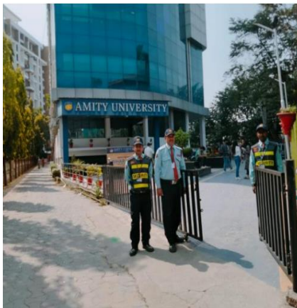
(Assisted entry for Divyangjan at entrance)

The lifts and ramps are fitted in the campus for easy access to classrooms and other areas of the campus