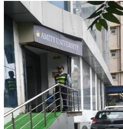
(Ramp with dedicated assistance personnel)